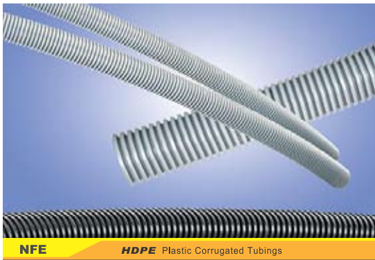
NFE HDPE Plastic Corrugated Tubings