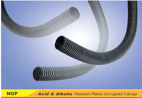
NGP Acid & Alkalis Resistant Plastic Corrugated Tubings